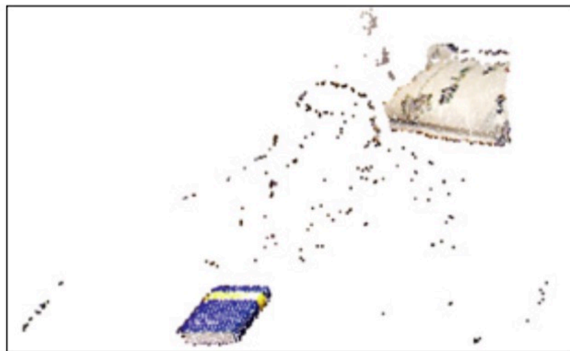
Fig. 10. Bed removal after changing the blanket: (a) memory information, (b) newly acquired information.